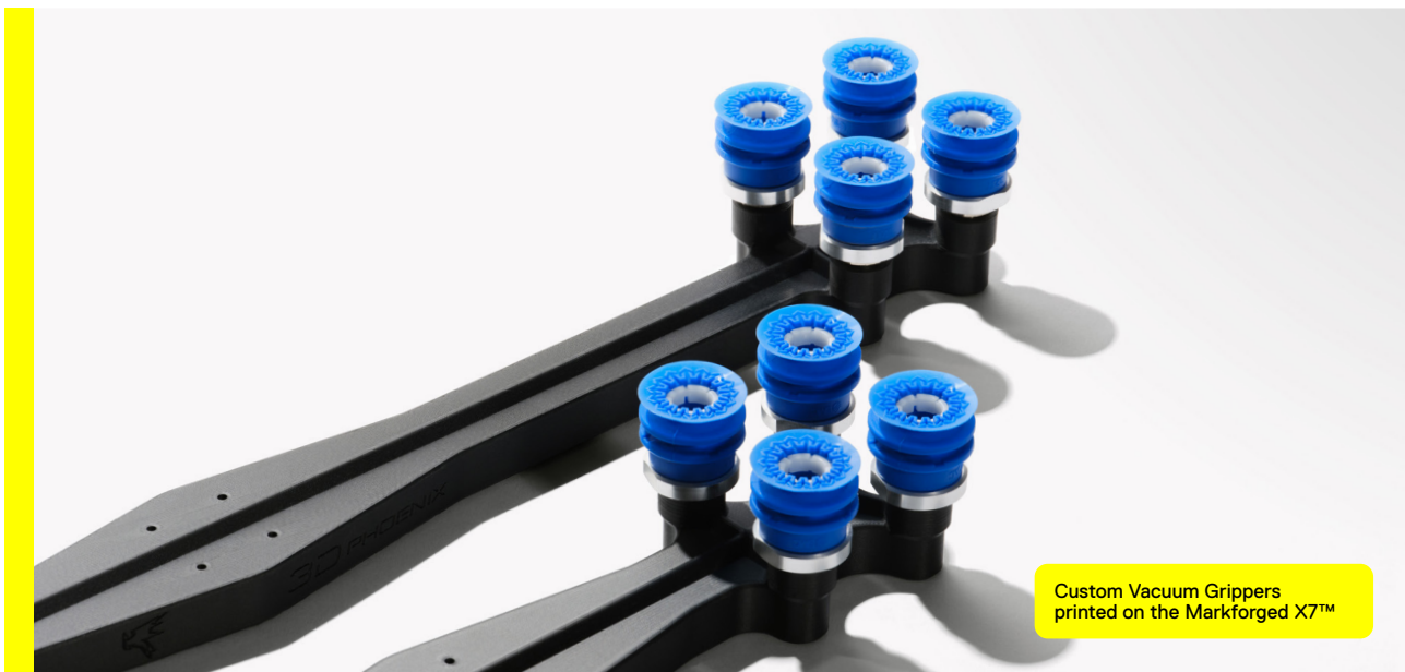
Custom Vacuum Grippers printed on the Markforged X7™